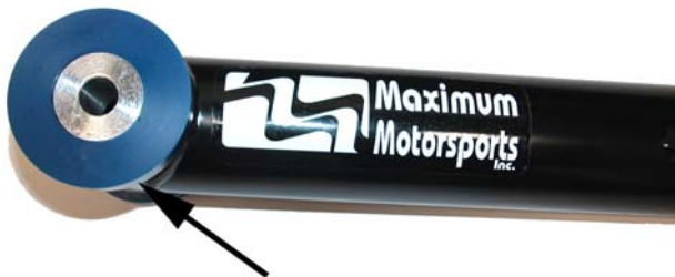
Urethane at Chassis End ONLY

Note: The axle end of the control arms DO NOT need the Control Arm Urethane pieces.