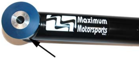
Urethane at Chassis End ONLY

Note: The axle end of the control arms DO NOT need the Control Arm Urethane pieces.