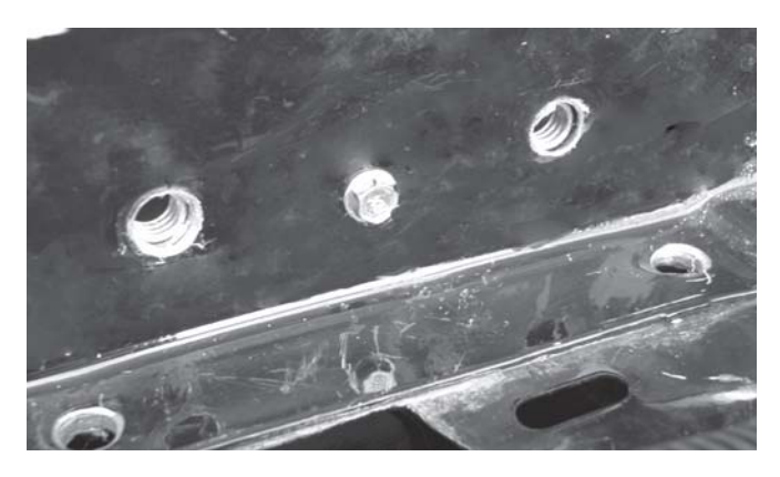
NOTE: This will secure the nutplate to the firewall, making future removal and reinstallation of the Strut Tower Brace significantly easier. The head of the sheet metal screw should line up with the hole at the back of the strut tower brace mounting pad.

33. Install the #8 sheet metal screw into the small hole in the nutplate. Remove the 5/16"-18 bolts.