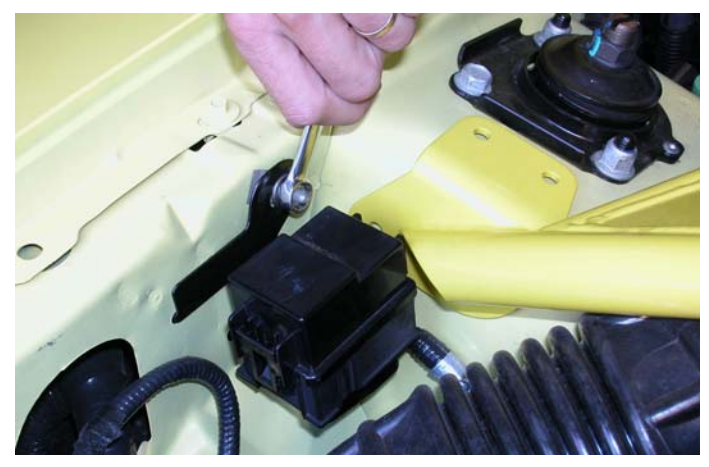
Vacuum Distribution Block Bracket (Driver's side rear of engine block)