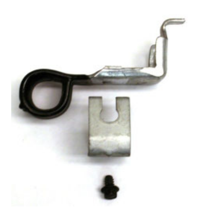
14. Tighten the ABS Bracket screw.