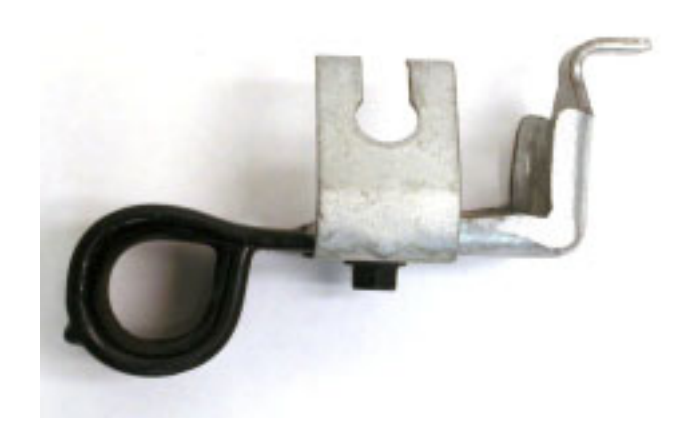
13. Flip the Parking Brake Bracket 180 degrees and place the ABS bracket on top of the parking brake bracket.