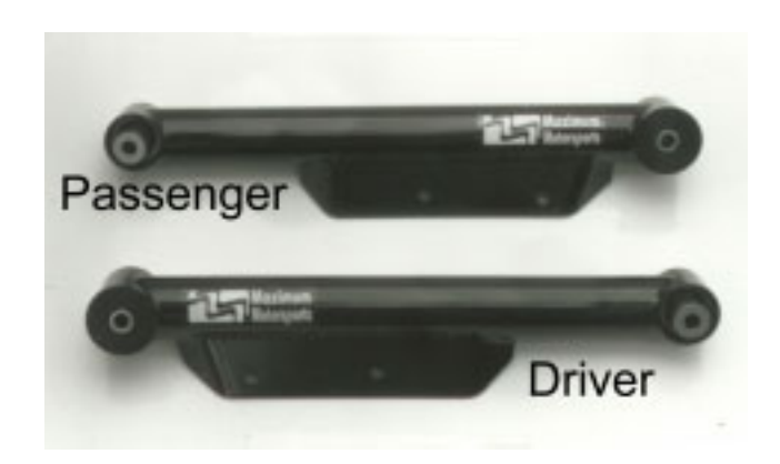
Read all instructions before beginning work. Following instructions in the proper sequence will ensure the best and easiest installation.

MMRLCA-1.3 requires the use of rear coil-overs.