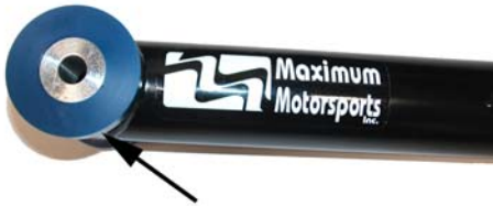
Urethane at Chassis End ONLY

Note: The axle end of the control arms DO NOT need the Control Arm Urethane pieces.