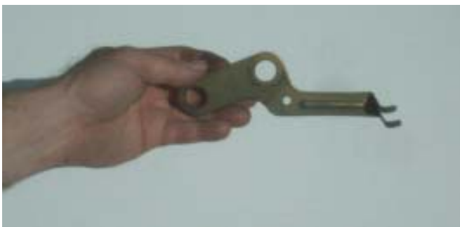
Bracket Before Modification

38. If the car has ABS, the mounting bracket for the sensor will need to be modified.