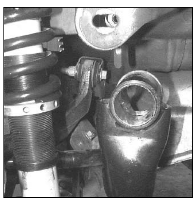
11.Apply a thin layer of the supplied grease on the interior surface of each shell and to the exterior surface of two MM Polyurethane IRS Subframe Bushings.