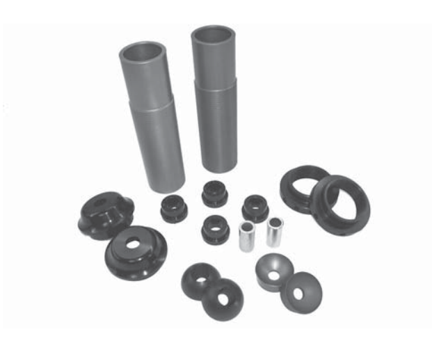
Read all of the instructions before beginning work. Following the instructions in the proper sequence will ensure the best and easiest installation.

Thank you for purchasing Maximum Motorsports' ultimate IRS coil-over conversion kit. This kit is manufactured specifically for Mustang Cobra IRS Koni shocks. There are many features you will find that set our coil-over kit apart from the rest. Starting at the top: