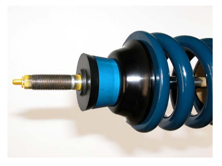
You have now completed assembling one coil-over assembly. Repeat steps 13-22 for the second shock.

22. Place one of the Delrin pivot balls on the shock shaft with the curved side facing down toward the aluminum pivot socket.