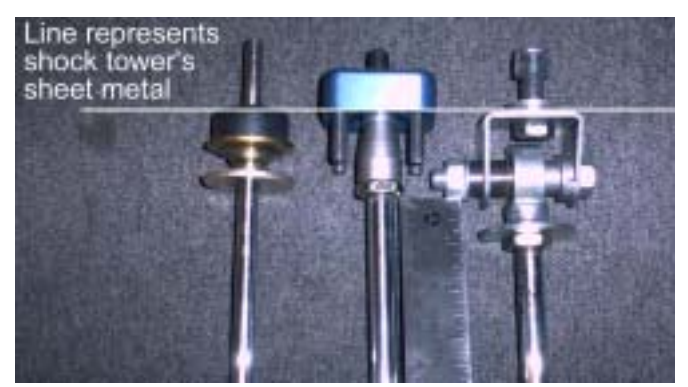
NOTE: The installation of the upper shock mount is not easily reversible. Due to the drilled holes, the shock tower will be too weak if the shock is run in stock configuration without welding the holes closed.