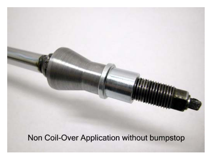
You have now completed one shock assembly. Repeat steps 14-20 for the second shock.