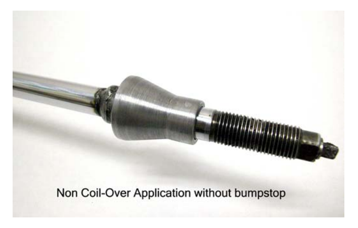
20. Place a Shock Shaft Reducer onto the shock shaft with the larger diameter on the bottom.