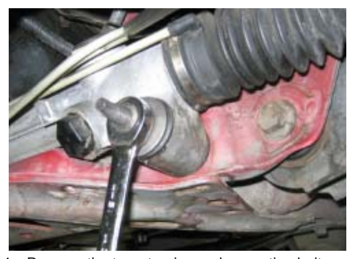
4. Remove the two steering rack mounting bolts.

Remove the two nuts and washers holding the steering rack to the k-member.