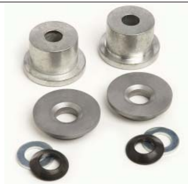
Read all instructions before beginning work. Following instructions in the proper sequence will ensure the best and easiest installation.

Thank you for purchasing the Maximum Motorsports Aluminum Steering Rack Bushing Kit. The MMST-7 kit is specifically designed for use with stock kmembers.