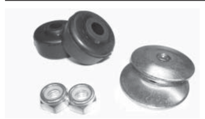
Read all instructions before beginning work. Following instructions in the proper sequence will ensure the best and easiest installation.

Thank you for purchasing Maximum Motorsports' rear upper shock mount rubber isolator replacement kit. This kit is designed specifically for use with the MM IRS coil-over kit and the rear OEM 2003-04 Cobra Bilstein shocks. Due to the shorter height of the stock 2003-04 Cobra rear upper shock mount rubber isolator, there is not a sufficient amount of threads on the shock shaft to adequately preload the isolator. If the rubber is not correctly preloaded, a "clunking" noise will result from the Delrin ball impacting the rear shock towers.