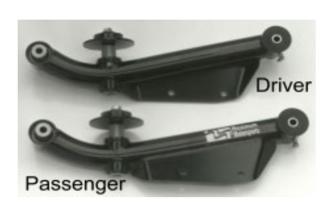
Read all instructions before beginning work. Following instructions in the proper sequence will ensure the best and easiest installation.