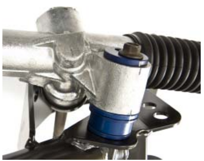
NOTE: If the rubber cover of the steering shaft input still rubs on the K-member, the black cover can be removed or trimmed.