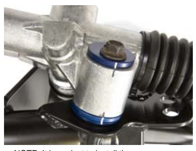
NOTE: It is easiest to install the spacers on one side of the steering rack at a time.